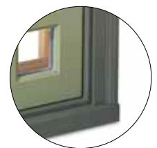
2" brick mould and 1 1/2" sill nose, shown on a casement window

Choose exterior trim in either a flat casing, brick mould or sill nosing profile to add curb appeal to your home.