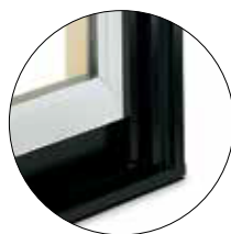
Colony white and black

Choose a custom exterior color to get just the right color for your design. And, with our 2-, 3- and 4-tone color combinations, the sky's the limit. Mix and match up to four of our 50 exterior colors for a combination look that's all your own.